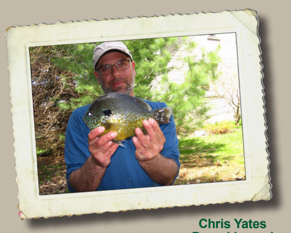
Pumpkinseed 1.37 lbs. in 2018